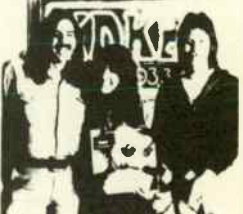
SMOKEY ROBINSON - Contemporary recording artists appear on our charts as well as on the national charts. SMOKEY ROBINSON is featured on our charts during a live performance in Dallas with station KJEM-Dallas.