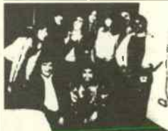
SMOKEY ROBINSON - Contemporary recording artists appear on our charts as well as on the national charts. SMOKEY ROBINSON is featured on our charts during a live performance in Dallas with station KJEM-Dallas.