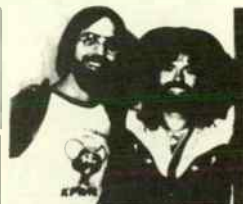
SMOKEY ROBINSON - Contemporary recording artists appear on our charts as well as on the national charts. SMOKEY ROBINSON is featured on our charts during a live performance in Dallas with station KJEM-Dallas.