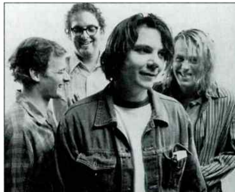
From left, John Stirratt, Ken Coomer, Jeff Tweedy, Jay Bennett

Since his early '90s stint in Uncle Tupelo , songwriter/singer/guitarist Tweedy has been regarded as one of the leading protagonists of country/rock, a style that he ironically stumbled on following an initial interest in punk. In fact, the 29-year-old attributes picking up an electric guitar to "maybe even just the pictures on the back of 'London Calling.'" "Being There" was inspired by "being immersed in music on every level. I think most of it either comes from listening to records or being in a band or realizing that I spent my whole life placing maybe an inordinate amount of importance on this kind of thing." He adds that the album, which has the overall feel of Neil Young fronting a Replacements/Jayhawks/Soul Asylum band putting their own spin on "Exile On Main Street," was intended to