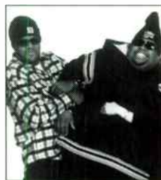
Ed Lover & Dr. Dre Morning Hosts WQHT New York