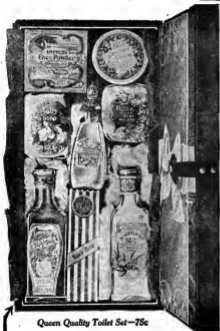
Queen Quality Toilet Set—75c