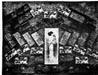
No. 20—Chocolate Deal (see illustration), 1,000 size as in. Our Price, $21.00. SALESMEN, ATTENTION!—Our small size assortments are being ordered over in thousands. Our size 1 1/2. Cash in on this bargain. We have quantities in your territory.

WE SELL MORE TACKLE AND OUTING ASSORTMENTS THAN ALL OTHER SALESBOARD FIRMS COMBINED. Displays contain only best grade merchandise of leading manufacturers. Each pertains to its class and the best that can be bought. Includes sport &; trophies and items making sets. All with top notch artwork, finished finish, and/or fine workmanship. Big, Little, Dogwood, Delaware, Gwynne's Sporting Goods, All Four, Java, Philadelphia, "Company" Tool Sets, Compasses; in fact, every product, dependable making necessary. Quantities are below general market prices.