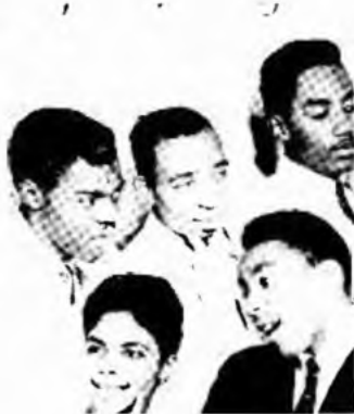
The Miracles . . . the Tamla Records' artists currently on a series of one-nighters, follow up their hit, "Shop Around," with Ain't It Baby."