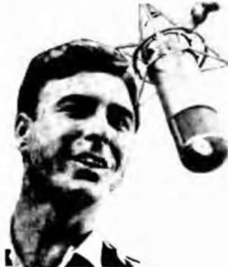
Johnny Horton . . . despite his tragic death, his album, "Johnny Horton's Greatest Hits," continues to be a best seller on both mono and stereo charts.