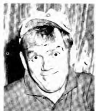
Woody Woodbury . . . has a laugh riot to add to his previous best selling albums . . . still riding high on the sales charts. Title: "Concert in Comedy."