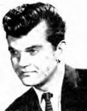
Conway Twitty . . . gives a musical history of Rock 'n Roll in his album, "Rock 'n Roll Story." His recent single, "C'est Si Bon," was a hit.