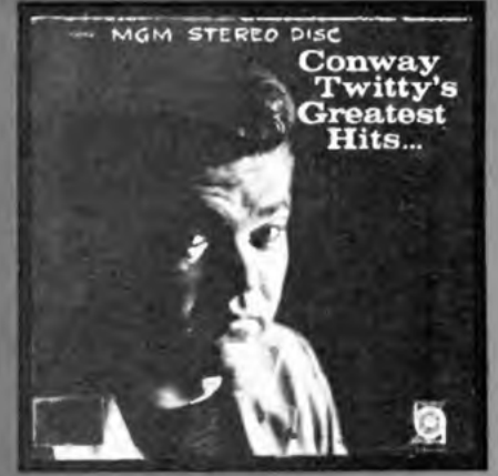
CONWAY TWITTY'S GREATEST HITS E3849