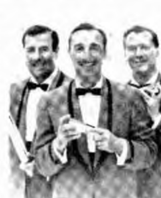
Jerry Murad's Harmonicats . . . are featuring their hit single, "Cherry Pink and Apple Blossom White," on their current tour.