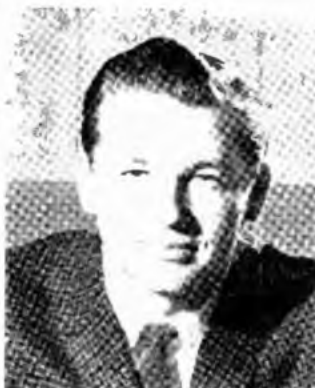
Floyd Cramer . . . zooms into the "Hot 100" with his second release, "On the Rebound," a smash follow-up to his big hit, "Last Date."