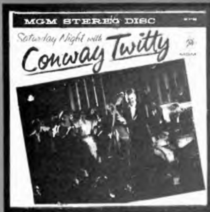
SATURDAY NIGHT WITH CONWAY TWITTY E3786