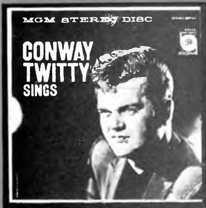
CONWAY TWITTY SINGS E3744