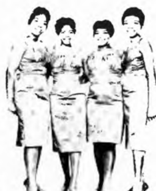
The Shirelles . . . are currently riding high on the strength of two back-to-back hits . . . "Dedicated to the One I Love" and "(Will You Love Me) Tomorrow."