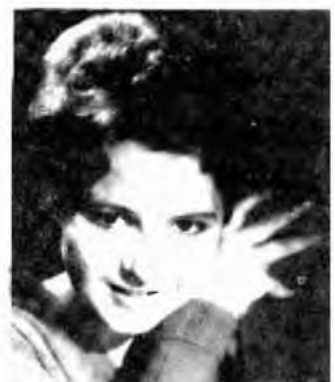
Brenda Lee . . . sixteen-year-old charmer, is currently on the charts with "Emotions" and will soon begin filming her first movie, "Teddy Bear."