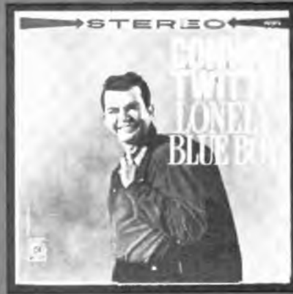
CONWAY TWITTY LONELY BLUE BOY E3818