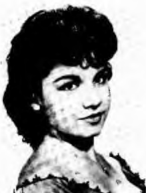
Annette . . . is in Hollywood filming "Babes in Toyland." Current album, "Dance Annette." Current single, "Dream Boy" b/w "Please, Please, Signore."