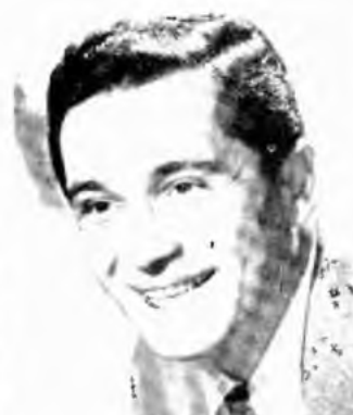
Perry Como . . . television's Mr. C and one of the industry's most popular performers, has a new RCA Victor release entitled "Young at Heart."