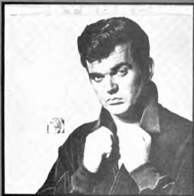
THE ROCK & ROLL STORY CONWAY TWITTY E3907