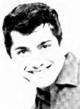
Paul Anka . . . talented, young ABC Paramount composer-performer, will soon make an in-person appearance at Miami's lavish Fountainbleau Hotel.