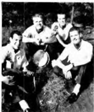
The Brothers Four . . . appear on the Bell Telephone Hour soon after a cross-country tour of colleges. Their latest single is "The Frogg."