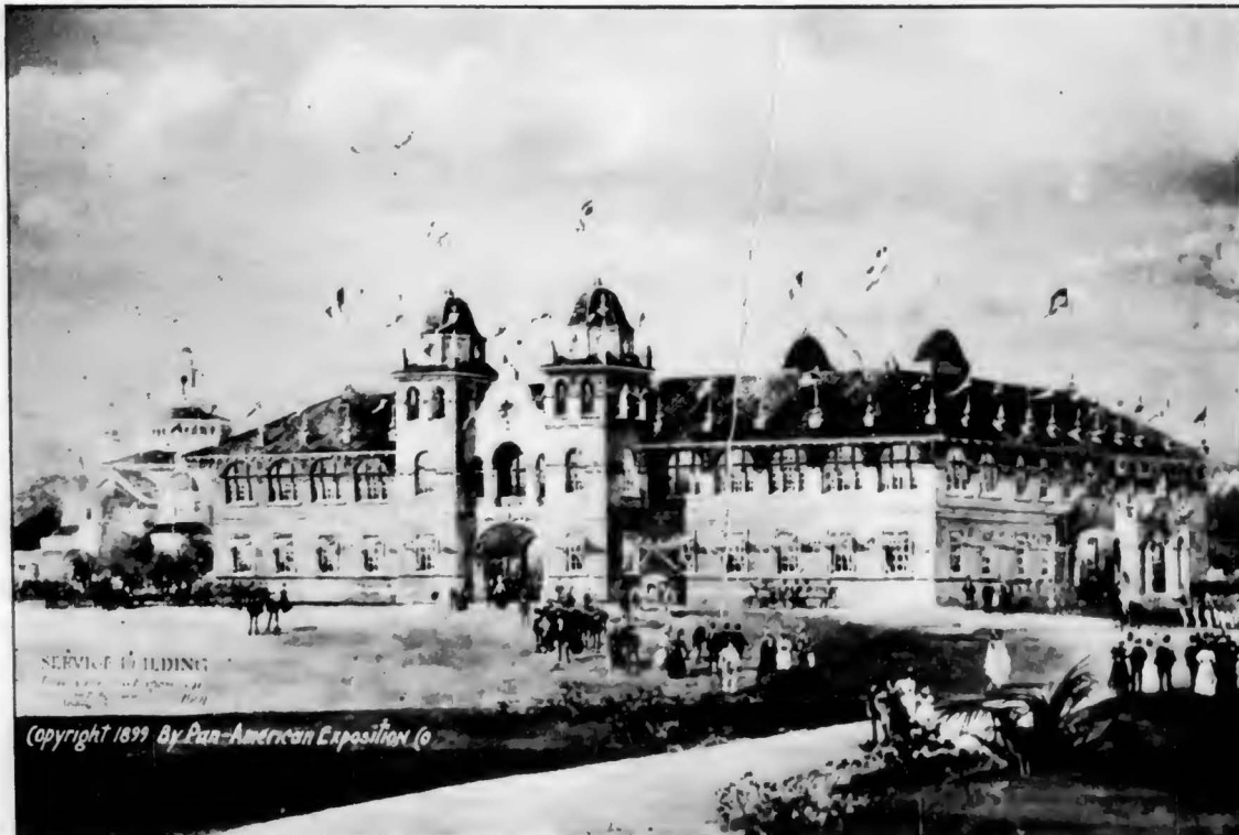
Service Building, Pan-American Exposition.