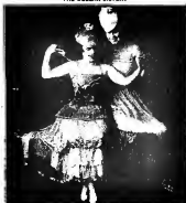
Stage and Screen Stars, the Dollar Sisters, in their new act, "The Dollar Sisters."