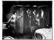
Home in a FINE HOME, JACKSON-STONE AVENUE, with SHAMKIN, Pa.