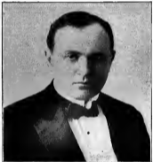
Managing Director of The Grand and the Metropolitan, New York, who follows in the "Theatrical Footsteps" of his father.

It is not a play in itself. It is not a play in itself. It is not a play in itself. It is not a play in itself. It is not a play in itself.