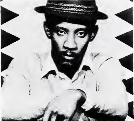
Linton Kwesi Johnson