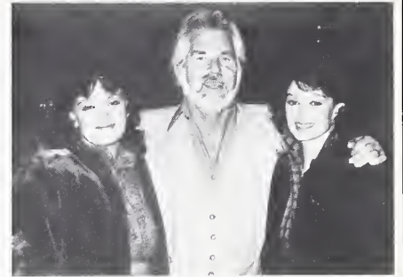
PALACE MEETING — RCA's mother-daughter duo, The Judds, recently met labelmate Kenny Rogers at his concert at The Salt Palace in Salt Lake City. Pictured above are (l-r): Wynonna Judd, Rogers and Naomi Judd.