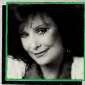
LORETTA LYNN Hall of Fame