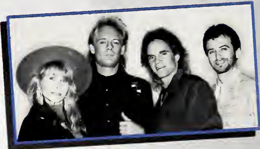
HIGHWAY 101 Vocal Group of the Year