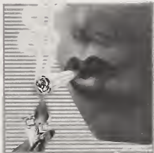
SHE WANTS YOUR MONEY