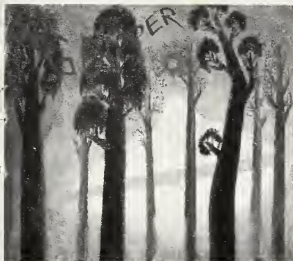
BIG DIPPER'S HEAVENS – The best album of 1987, period. Can they top it?

S TOP THE PRESSES – Just out this week is “Meet The Witch,” the first single off the new Big Dipper album, Craps , on Homestead Records. It’s a typically melodic, guitar clang-a-rama from the rockin’-est band of short-haired smarties in the musical universe. If you haven’t yet boarded the Big Dipper bandwagon, it’s not too late. Comprising ex-members of Dumptruck , Volcano Suns and the Embarrassment , Big Dipper vaulted to the top of many literate listeners’ “best of” lists with last year’s incredible Heavens LP. It’s no exaggeration to say that Craps is as eagerly awaited as any alternative-type album of 1988.