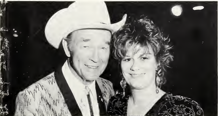
Country sensation K.T. Oslin, named 1988 CMA Female Vocalist of the Year is congratulated by 1988 Hall of Fame inductee Roy Rogers after the live telecast of the 22nd Annual Country Music Association Awards Show.