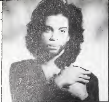
#1 Single: Prince