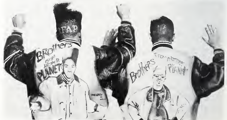
Brothers From Another Planet