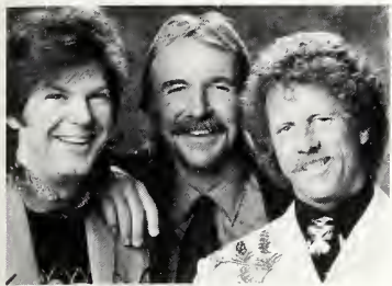
John Jorgenson, Herb Pederson and Chris Hillman