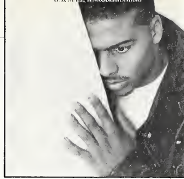
High Debut: Al B. Sure