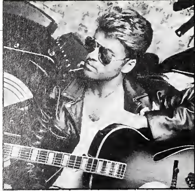
High Debut: George Michael #30

(G) = GOLD (RIAA) Certified (P) = PLATINUM (RIAA) Certified