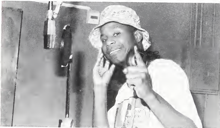
Doug E. Fresh