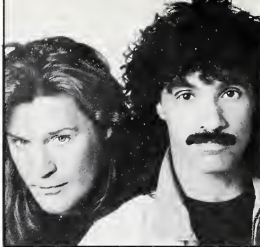
High Debut: Hali & Oates #70