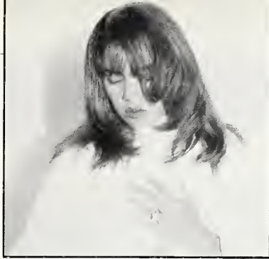
#1 Single: Pebbles