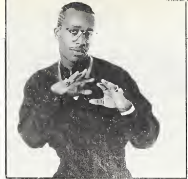
To Watch: M.C. Hammer #51