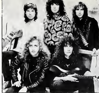
To Watch: Alias #47