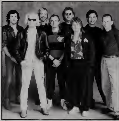
High Debut: Yes #82