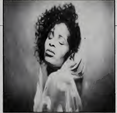
To Watch: Innocence #40