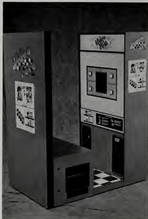
Data East's 'Video-Foto' Booth