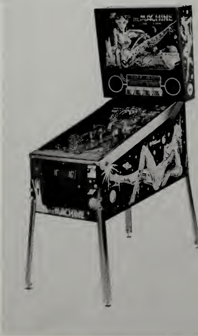
The Machine: Bride Of Pin-Bot

Further information may be obtained through factory distributors or by contacting Roger Sharpe at 312-267-2240.