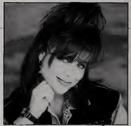
To Watch: Paula Abdul #25