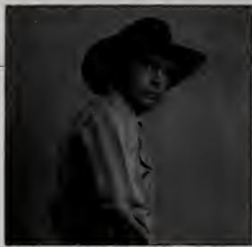
High Debut: Garth Brooks #44