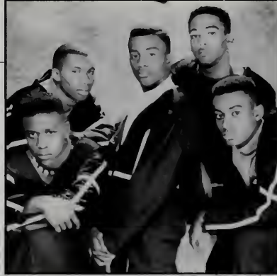
High Debut: Hi-Five #61