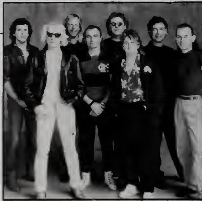
High Debut: Yes #37

(G) = GOLD (RIAA Certified) (P) = PLATINUM (RIAA Certified)