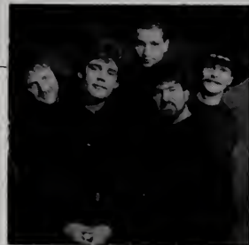
To Watch: Shenandoah #36