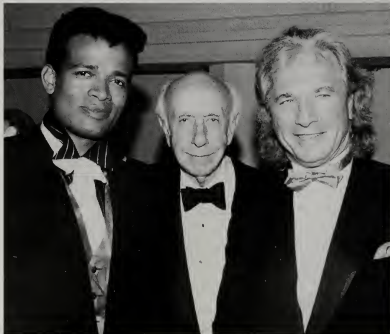
Shown here (l-r) are: Mario Van Peebles, ASCAP president Morton Gould and composer Maurice Jarre, who were among those in attendance at ASCAP's sixth Film & Television Awards. Jarre was honored as composer of the score for top box office of 1990, Ghost .