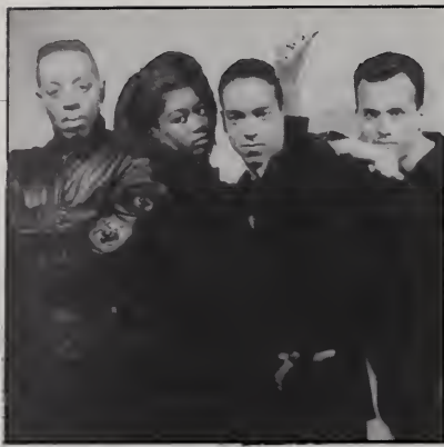
#1 Single: C&C Music Factory