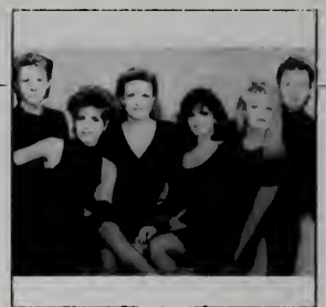
#1 Indie: The Hollanders #38