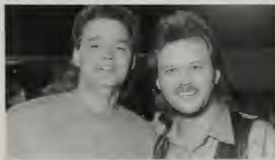
Doug Stone & Travis Tritt

MARK COLLIE PERFORMANCE BENEFITS "SPECIAL" SCHOOL —MCA Records recording artist Mark Collie recently performed in a special outdoor concert to benefit the Willow Hall School, a private facility which meets the special needs of children with learning disabilities, located in Franklin, Tennessee. Collie continues to ride a wave of phenomenal success with his debut album, Hardin County Line , which features his most recent single entitled "Let Her Go." Most recently, Collie returned to the studio to complete his second MCA project entitled Thunder Road , which is set for release this summer.