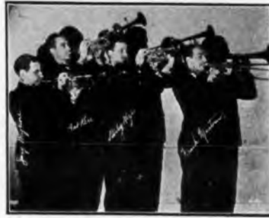
BRASS SECTION OF HENRY HALSTEAD ORCHESTRA Park Central Hotel, New York