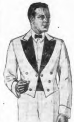
Angelica 24-E-2 (Above) Less than 12, each $3.50 12 or more, each $3.20