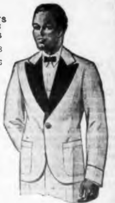
Angelica 24-E-4 (Above) Less than 12, each $3.50 12 or more, each $3.20

Sizes: JACKETS 34 to 48 PANTS Waist 28 to 48 Inseam 28 to 36