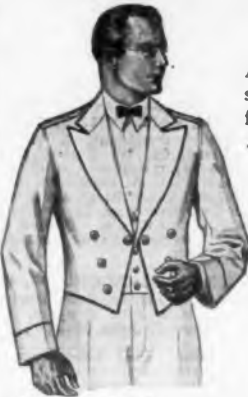
Angelica 24-E-1 (Above) Less than 12, each $3.50 12 or more, each $3.20

And every one a real buy from the standpoint of smart appearance, high quality material, excellent fit, and long wear. Order your "Angelicas" today ... they'll put you in tune with the new season!