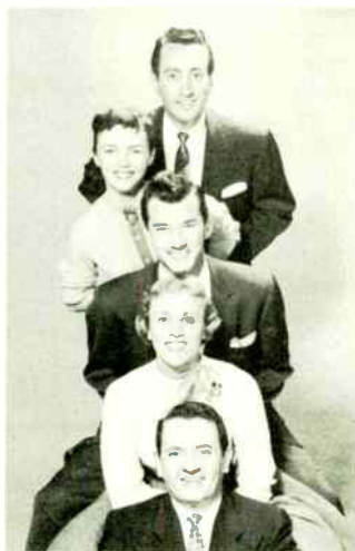
Currently holding forth as regulars on NBC-TV's "Dinah Shore Show," the Skylarks sing, dance and act.

Tony Marvin, announcer who still works for Arthur Godfrey, found himself in a rather embarrassing position recently. Marvin was scheduled to appear at Boston's Latin Quarter night club and then learned that the Mariners, recently fired by Godfrey, were to appear for three days on the same bill. The Mariners were being billed as "Arthur Godfrey's Axe-Friends."