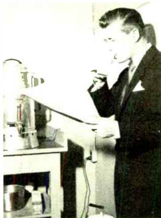
Gordon MacRae takes "break" during the recording session which produced his latest disk, "Bella Notte" and "Follow Your Heart."

It's been threatened many times, but a company in Denmark (a country already known for startling developments) has done it! The company is distributing a "silent" record for use in juke boxes. Anyone who wishes to nurse his beer in brooding silence has only to put a coin in the juke and press the button. A record which contains three minutes of nothing begins grinding away, leaving peaceful silence.