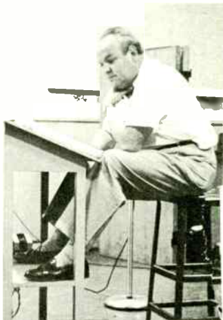
Billy May contemplates the arrangement while his orchestra runs down the latest Billy May disk, "Shaner Maidel" and "The Cha-Cha-Cha."

Although they had many requests to perform the song, the Four Aces had to drop the tune "Stranger In Paradise" from their act when they played their recent engagement at the London Palladium. A ban was put on the tune for vaude performances by the producers of "Kismet," now being presented in England. The producers felt that in-person performances of the show's big hit song would lessen the impact of the stage show.