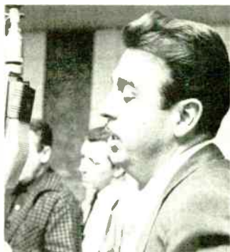
With his "Ballad of Davy Crockett" still on the charts, "Tennessee" Ernie Ford has a new one breaking for a hit currently, "His Hands."