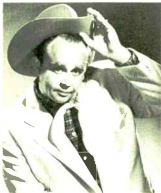
Cliffie Stone, well known in the country field, is making quite a stir in the popular market with clever record, "The Popcorn Song."