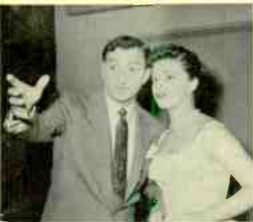
Danny Thomas explains the television facts of life to singer Anna Maria Alberghetti during rehearsal for a recent episode of Thomas's TV show, "Make Room For Daddy."