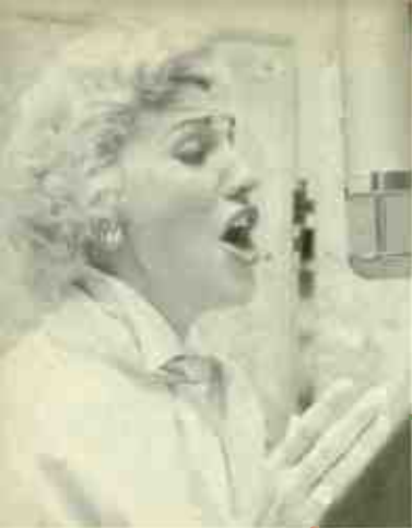
Patty Andrews, one of the famous Andrews Sisters, was signed recently to Capitol label as a single. First disk release is "Where To, My Love" backed by "Without Love."