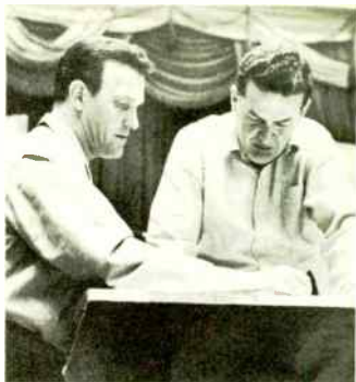
Country artist Eddy Arnold teams up with Hugo Winterhalter to make new RCA-Victor release, "The Cattle Call" backed by "The Kentuckian."