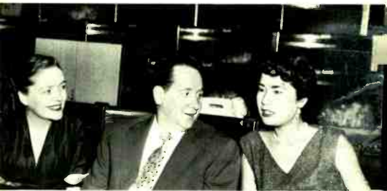
Les Paul and Mary Ford chat with Peggy Hayama, one of Japan's top singers, during rehearsal for a recent benefit show held at Carnegie Hall in New York. Les and Mary have a new one breaking big on Capitol wax, "Hummingbird" & "Goodbye, My Love." Miss Hayama is with King Records.