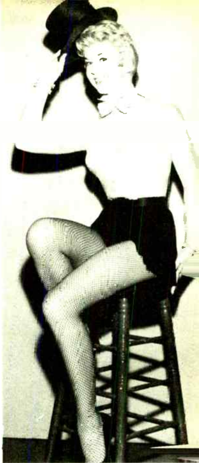
Doris Day, usually the girl-next-door type, gets a cheesecake treatment for M-G-M's musical life story of Ruth Etting, "Love Me or Leave Me." Pic co-stars James Cagney.

Anthony, who plays the tune in the flick, has previously been very successful in establishing the "Bunnyhop." Introduced by Anthony in 1952, the dance is now firmly established and is played by nearly every major band in the country.