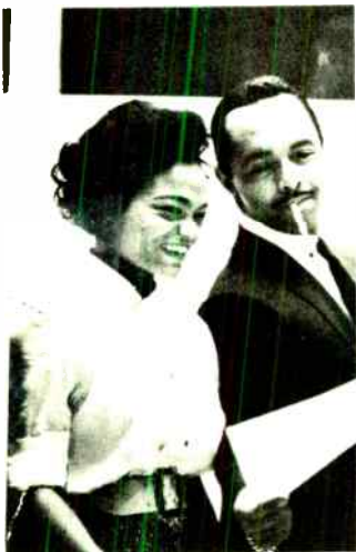
Another in Victor's "double-date" series pairs up Eartha Kitt and Perez Prado on "Sweet and Gentle."