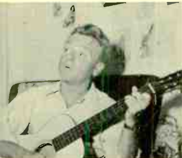
Although not primarily known as a musician, James Cagney plucks a mean guitar in spare time. Here he entertains troupe of "Mister Roberts" during shooting of film.