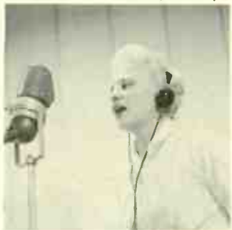
Peggy Lee cuts soundtrack for the "Sing a Rainbow" number heard in the film "Pete Kelly's Blues" being produced by Jack Webb who also directs and stars for Warner Bro