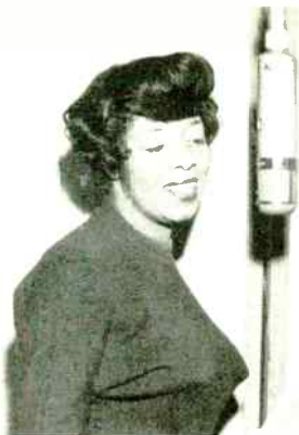
Dakota Staton, one of Capitol's new and talented artists, records her latest disk, "Don't Leave Me Now."