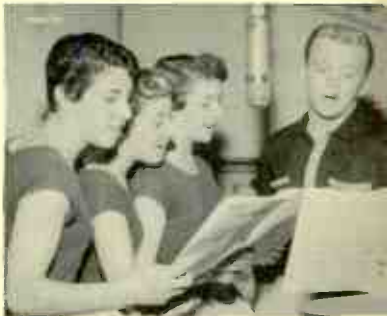
This youthful quartet is made up of the three Paris Sisters with Bing's eldest, Gary. They teamed up on Decca wax to record newest disk, "Truly" and "His and Hers."