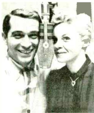
Affectionately caressing the microphone, Perry Como and Jaye P. Morgan prepare to wax latest disk on RCA-Victor, "Two Lost Souls."