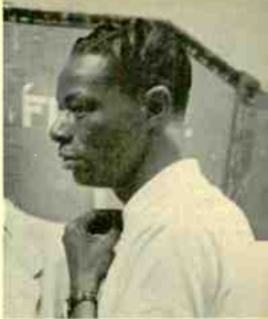
Nat "King" Cole listens to playback of new hit disk, "My One Sin." Flipside is "I'd Rather Have the Blues," which he sings in Mickey Spillane movie "Kiss Me Deadly."