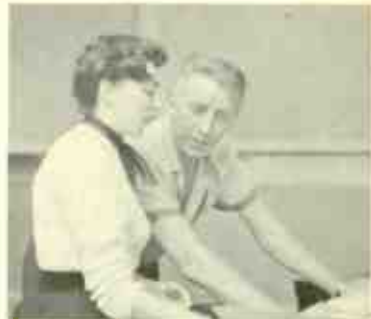
Ann Richards, new vocalist with Stan Kenton ork, looks over the arrangement with the maestro. She is heard on two big Kenton releases, "Casanova" and newest, "Freddy."