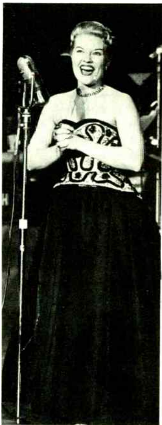
Patti Page appears on the Comedy Hour TV show to plug her most recent release on Mercury, "I Love To Dance With You" "Near To You."