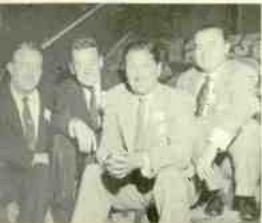
Harry James, Les Brown, Lawrence Welk and Freddie Martin take off a moment from a recent Dance Orchestra Leader Association to pose for pix. Brown's now on Capitol.