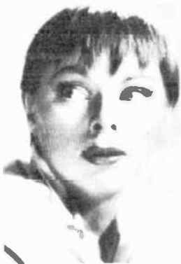
Carol Haney adds singing to her dancing talent by signing MGM Records contract. "Pajama Game" dancer's first record is out now.