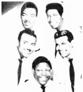
This happy-looking and moustached quintet bills itself as The Five Keys. Their newest on Capitol is the swinging "Gee Whittakers!"