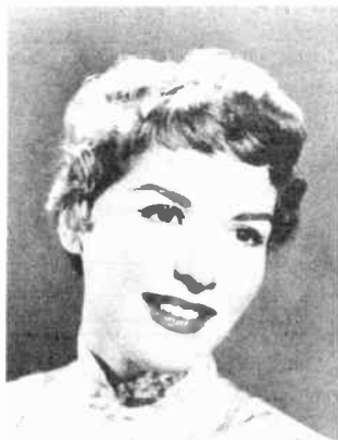
Petula Clark, "Miss Television" in Great Britain, made her American recording debut on MGM label with novelty, "Pendulum Clock."