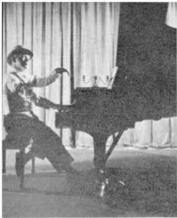
Replete with candelabra, a brass spittoon, derby, etc., Joe "Fingers" Carr goes highbrow on new Capitol album, "Carr Plays the Classics."