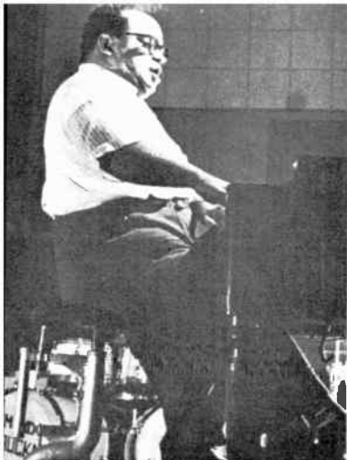
Hammond organ music barrel-house style is offered by Milt Buckner in his current toe-tappin' album, "Rockin' with Milt" on Capitol.