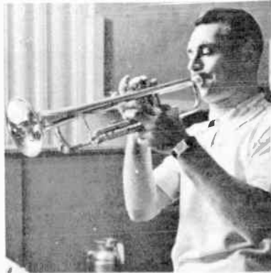
The man with the horn is handsome Ray Anthony whose latest Capitol single is "Flip Flop," latest album simply titled "Ray Anthony."