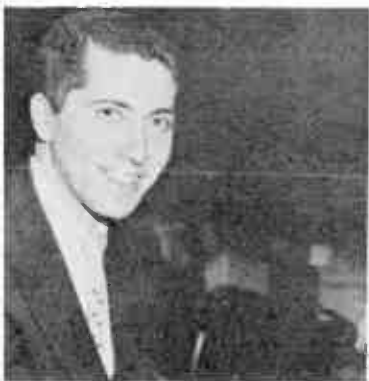
This is George Wallington, whose quintet has cut "At the Bohemia" album on the Progressive label. New York's Club Bohemia inspired.