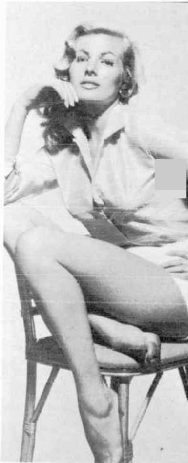
"Choirwoman" of the day is bare-footed lass named Anita Ekberg. She is seen in Warner's "Casablanca" over the ABC-TV network.