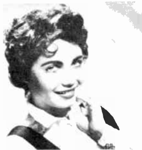
Relates life with brothers