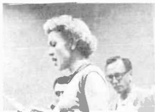
Ella Mae Morse runs through a chorus before recording her new Capitol wax with Big Dave ork, "Sing-ing-ing-ing," novelty tune.