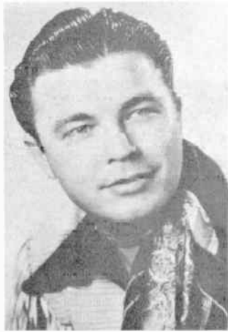
Ramblin' Jimmie Dolan's latest for Capitol, "Black Denim Trousers and Motorcycle Boots" was first recorded by Cheers for Cap Records.

The current production will have its own original score.