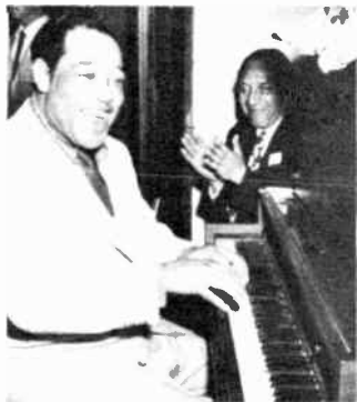
Ardent, hand-clapping fan of Duke Ellington watches maestro bang out song on piano which is featured in Cap album, "Dance to the Duke."