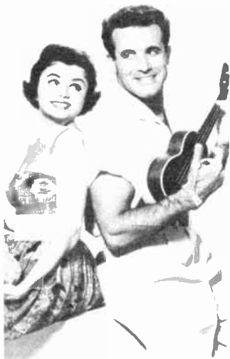
Handsome Dick Contino drops his accordion, picks up uke as pert Gloria Grey looks anything but blue on NBC TV in Hollywood.