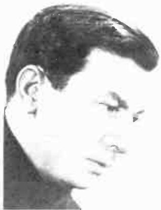
Violinist Nathan Milstein performs Beethoven's masterpiece, "Concerto In D Major" accompanied by the Pittsburgh Symphony on Capitol.