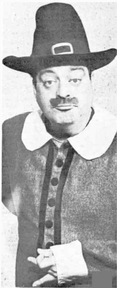
Nattily attired for Turkey Day this month is Jackie Gleason. He was more serious when he recorded new Cap album, "Romantic Jazz."