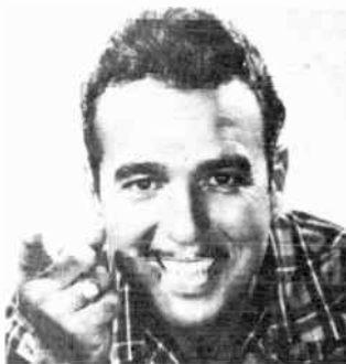
"Tennessee" Ernie Ford's newest pointing for success weighs in at "Sixteen Tons," composed by Merle Travis. Both are Cap artists.