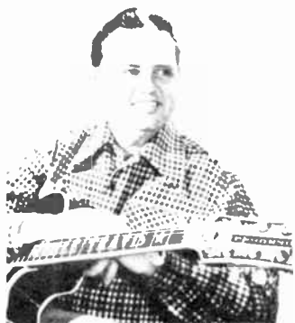
Personable Merle Travis awaits cue to start recording his newest Capitol single disk with the Whippoorwills of "Hunky-Dory."

The judge, upon hearing the evidence, said he was satisfied the disturber was creating an "abominable" noise, and fined him $8.40.