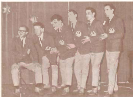
Casl recording artists The Carlton Showband

of the fastest selling singles in their roster. "Off To Dublin In The Green" was actually recorded in the famous Irish tavern by The Abbey Tavern Singers.