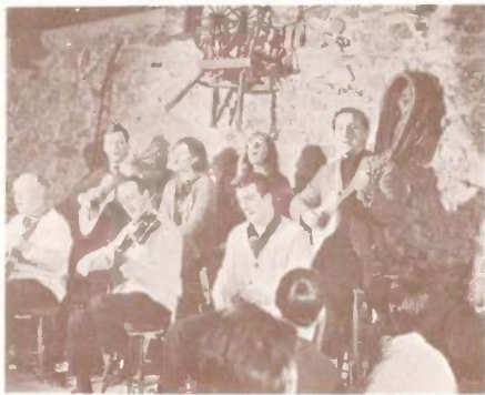
The famous Abbey Tavern Singers