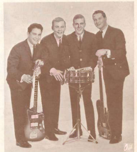
The Sceptres, one of Montreal's top rated groups, have just released "Can't Get You Off My Mind" and "Be My Love" on the Fi-Sound label, which is distributed by Allied Records.

As the chart grows in acceptance with record companies, it will be made available nationally. Many record companies are already taking advantage of the low ad rates and dealer and consumer reaction has been something short of fantastic. See page 5.