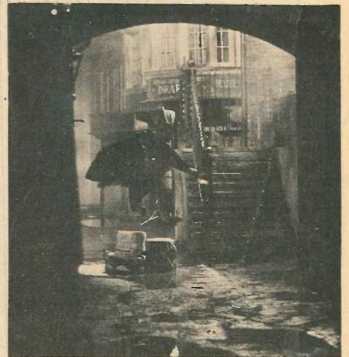
Jack Palance on location in Toronto.