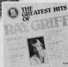
THE BEST OF RAY GRIFF (BOS 7219)

All titles available from Boot Records in LP, 8-Track & Cassette