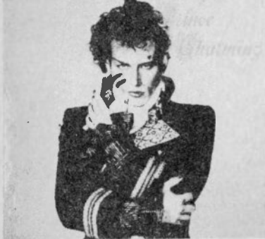
ADAM AND THE ANTS Rock Prince Charming - Epic JE-37615-H This is the third album try by this group that perform on disc as colourfully as they

look. Their music is rock with a definite difference. They have already captured a fairly large sized Canadian audience through their summer dates in Toronto and Vancouver. A major tour of Canada and the U.S. is expected for the spring. Adam is actually Stuart Goddard and, of course, he does all the vocals. The other members of this rogue ensemble are drummer Terry Lee Miall, guitarist Kevin Mooney, another drummer, who goes by the name of Merrick and another guitarist named Marco Pirroni. No single at time of writing but choice cuts are Stand And Deliver, Picasso Visita El Planeta De Los Simios or the really top choice of the title track.