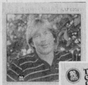
ADAM'S CHILD (BOS 7221)