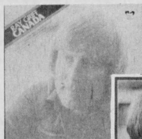
CANADA (Bos 7201)