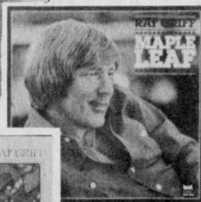
MAPLE LEAF (BOS 7210)