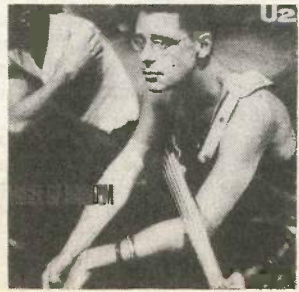
ANGEL OF HARLEM U2 Island - 97085-J