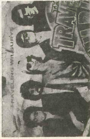
TRAVELING WILBURYS Volume One Wilbury - 92-57961-P