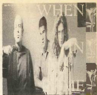
HEAVEN KNOWS When In Rome Virgin - VS-1471-W