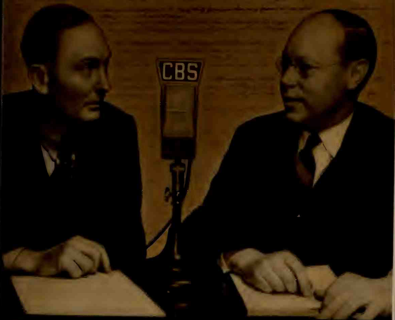
Wanted! of the People. H. N. ... TVS ... left ... Robert Taft ... right, discuss national problems weekly. See page 26