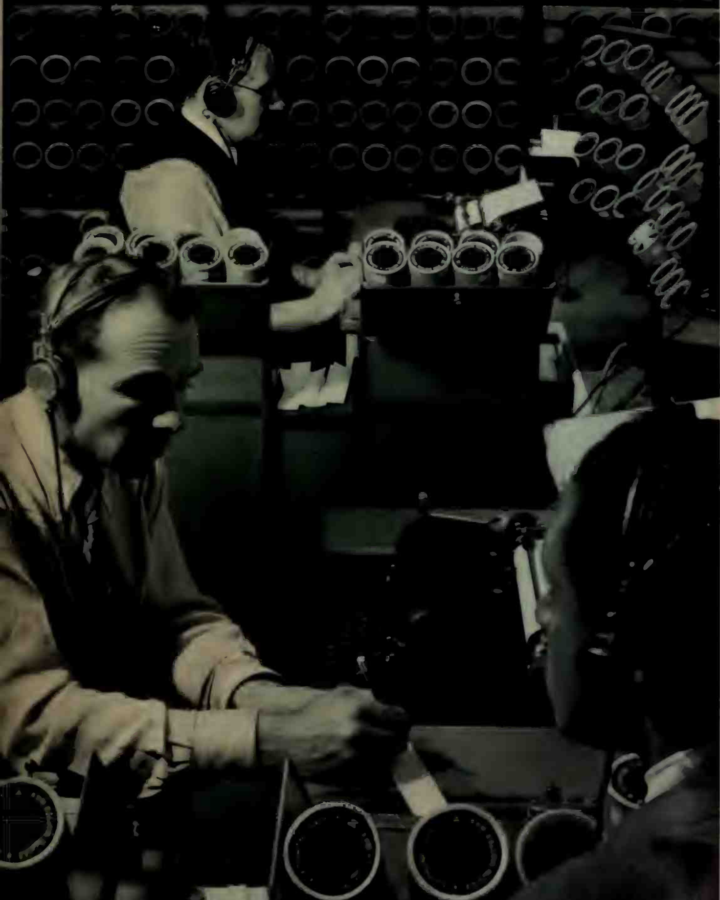
CBS short wave "listening post" on 24-hour duty for news from abroad