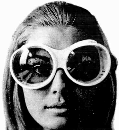
"THEY" now listen to the Young Sound all day long, every day, from 6 a.m. to 2 a.m. on WCBS/FM 101.