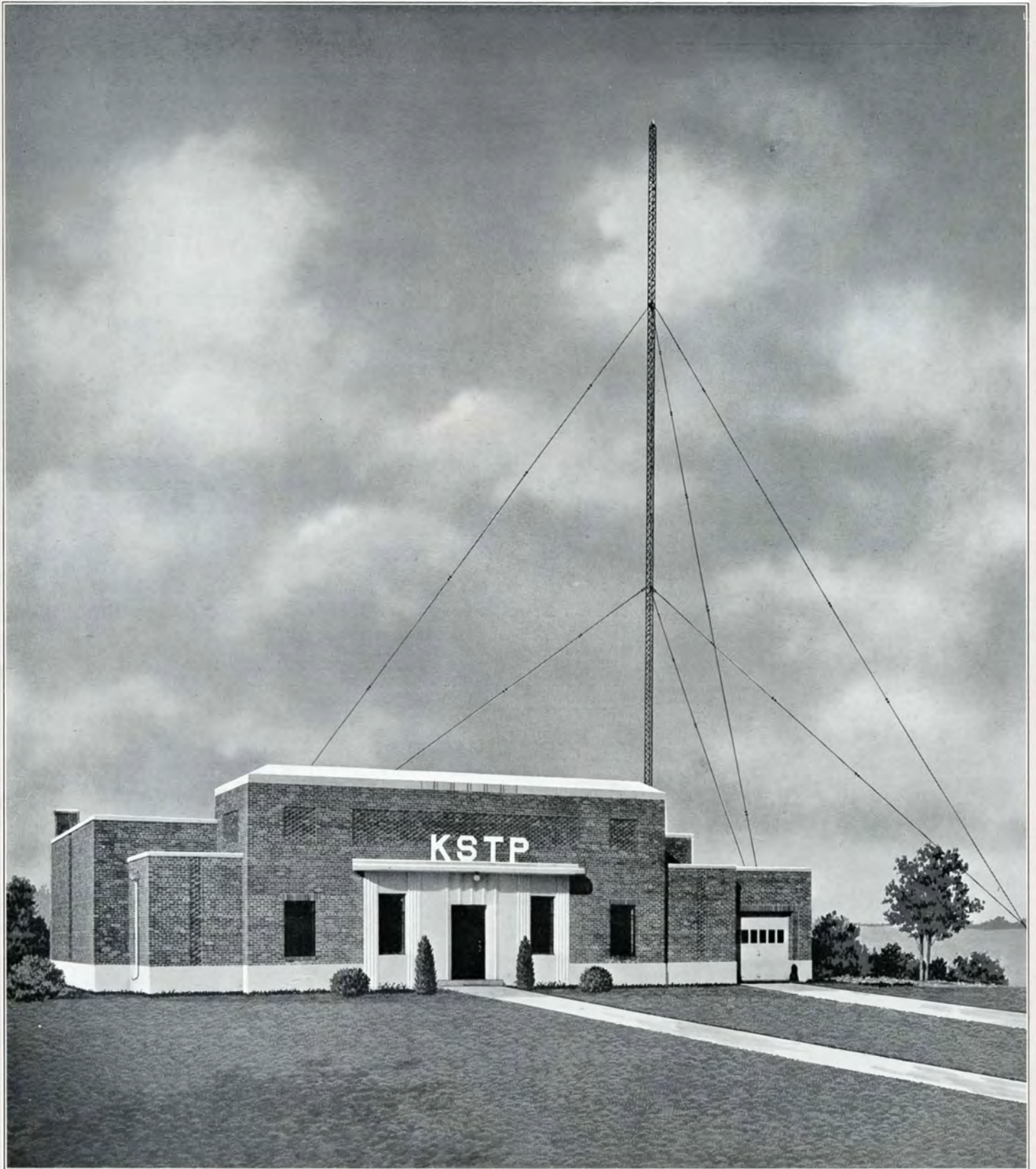
The ultra-modern new KSTP transmitter is located north of and mid-way between the Twin Cities. An unexcelled fidelity of tone and life-like reception has resulted from our modernization program.