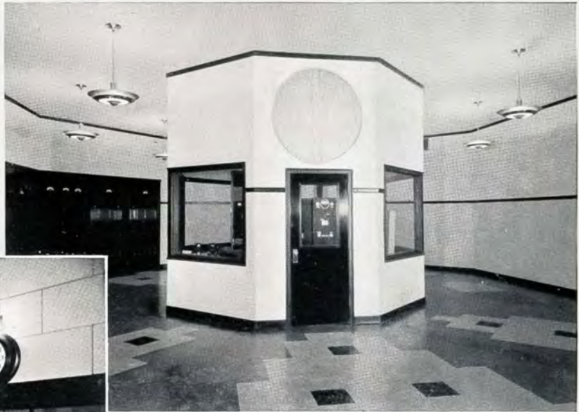
INTERIOR OF NEW TRANSMITTER

True to tradition, KSTP never rests on its laurels. Technical progress has kept pace with program enterprise. KSTP's new transmitter represents the last word in radio development. In engineering facilities as well as the beauty of their appointments, KSTP's new transmitter building and equipment is second to none in the country.