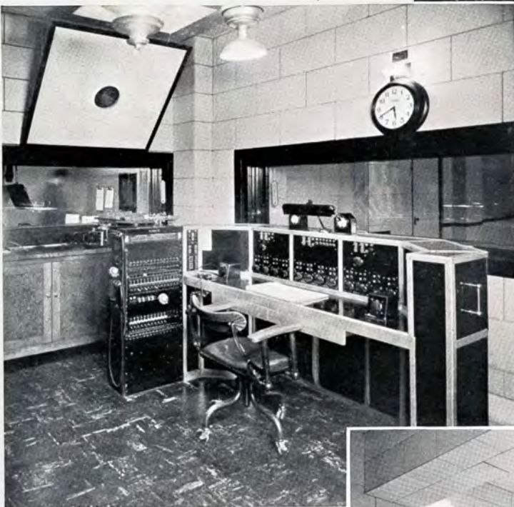
STUDIO MASTER CONTROL ROOM

The operators in the Master Control Room have the very latest facilities at their finger tips. The control panel is one of the most flexible ever designed. Nothing has been overlooked to render the equipment as reliable and efficient as possible.