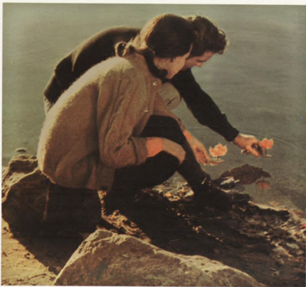
"Charly" starring Claire Bloom and Cliff Robertson who received an Academy Award nomination as best actor-1968.

"Mame," one of the outstanding musicals of this decade, to be produced as a motion picture. Co-financed with Warner Brothers-Seven Arts, production is expected to start in the latter part of 1969 or early 1970 for this major roadshow attraction.