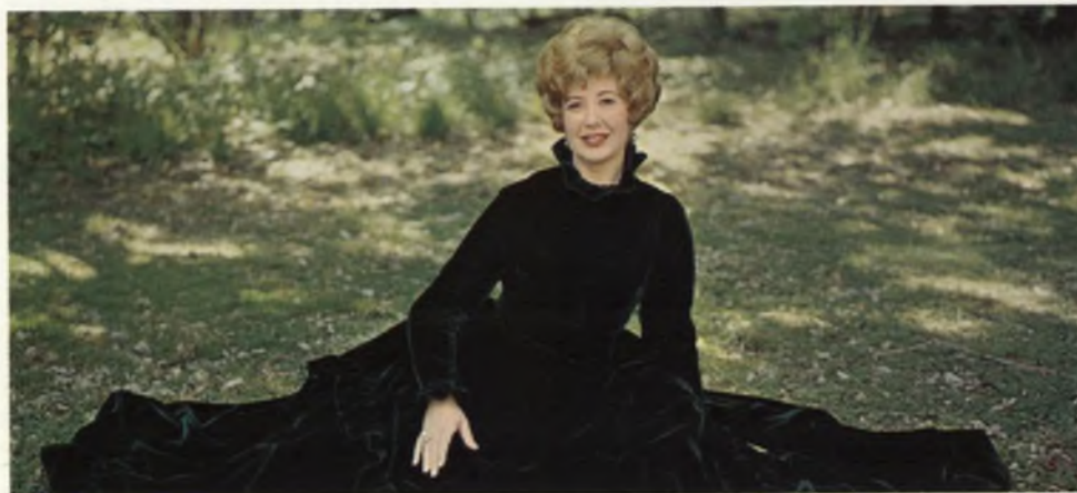
Beverly Sills, internationally famous soprano, recording on Westminster Records.