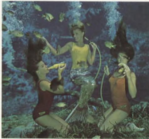
A performance by the "mermaids" of Weeki Wachee.