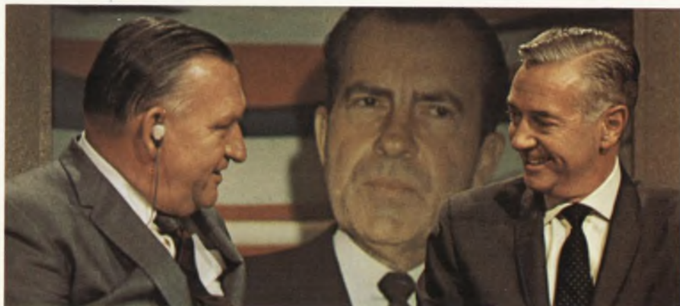
The Presidential election was a major news event of 1968. ABC News covered it from the primaries through the conventions and campaigns to Election Night. Reporting and analyzing developments were Frank Reynolds, anchorman of the "ABC Evening News," National Affairs Editor William H. Lawrence and Commentator Howard K. Smith.