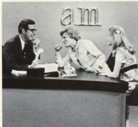
An informal visit by Mrs. Richard Nixon and daughter, Tricia, to the "A.M." show at KGO-TV, San Francisco.