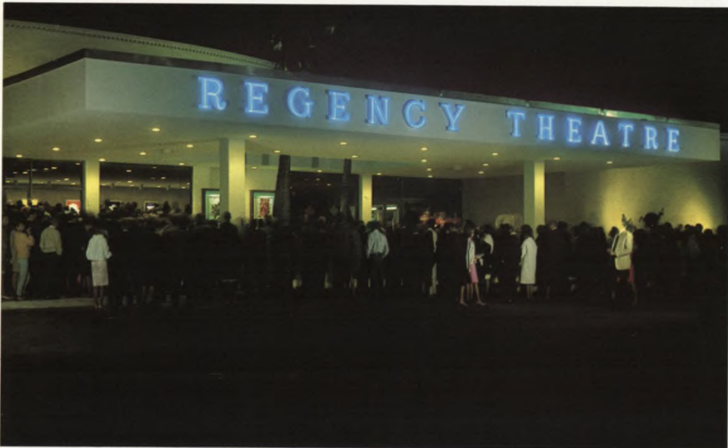
Regency Theatre in Jacksonville, Florida, one of twelve new theatres which opened in 1968.