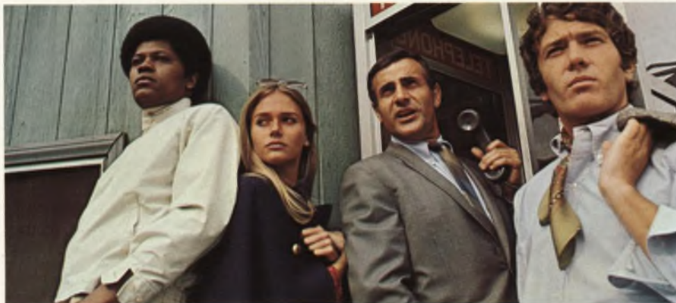
"The Mod Squad," one of this season's most innovative and talked-about new programs.