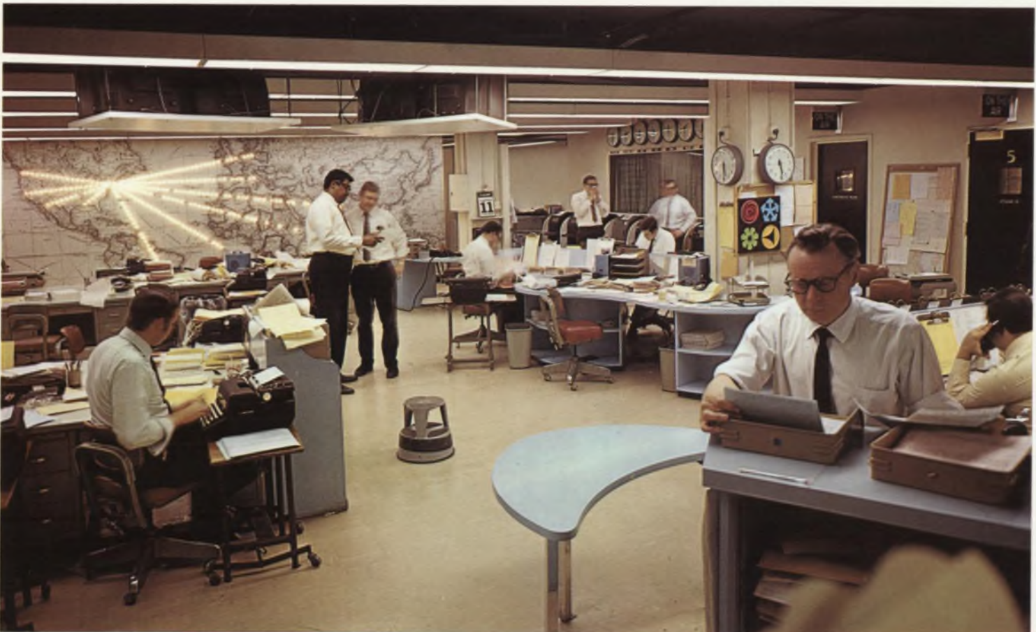
The major news center in New York for the network's four radio services.

The acquisition in July of KXYZ and KXYZ-FM in Houston brought the total number of owned radio stations to the legal limit of seven AM and seven FM stations. In entering the southwest, ABC is contributing to the growth of broadcasting in one of America's primary growth areas. By 1969, the population of metropolitan Houston was 1,778,000, making it the 13th largest market in the country. The move into Houston was particularly appropriate and desirable because the seven owned stations now are located across the nation in the dense and growing population centers of New York, Pittsburgh, Detroit, Chicago, San Francisco, Los Angeles and Houston. Following their acquisition, KXYZ and KXYZ-FM news operations were expanded. In the process, an ABC News Bureau was established in Austin, the State Capitol of Texas. Subsequently, the Houston stations were honored with the