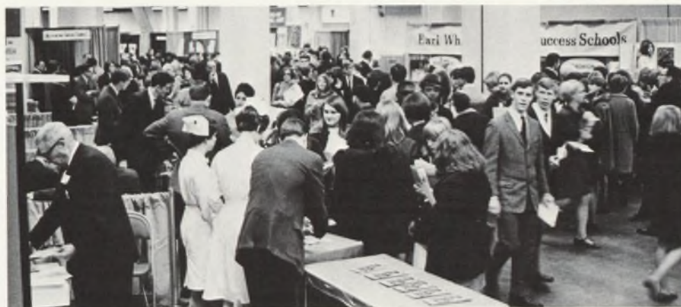
Annual Career Exposition created and sponsored by KQV in Pittsburgh.