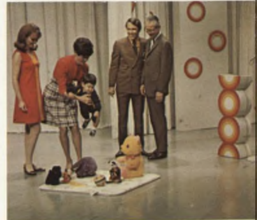
"The Anniversary Game," produced by the owned TV station group, is seen in its five markets and distributed by ABC Films.