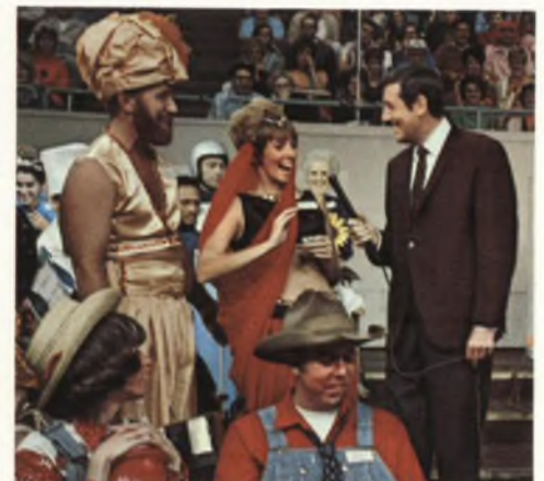
The popular daytime series, "Let's Make A Deal" with host Monty Hall.