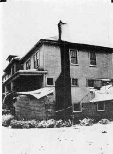
Above—Where Wheeling Gospel Tabernacle once stood.