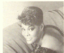
Dionne Warwick - BMG

Whitney Houston - Didn't We Almost Have It All Hot House - The Way We Walk Dionne Warwick - To be announced