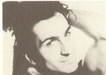
Paul Carrack - CBS