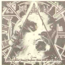
Def Leppard - Hysteria - Mercury