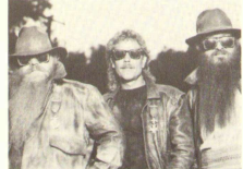
ZZ Top - WEA

All the above are part of the mid-price campaign