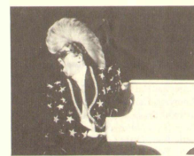
Elton John - PolyGram