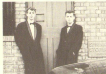
Pet Shop Boys - EMI

Brother Beyond - Get Even View From The Hill - View From The Hill Cliff Richard - The Guarantee The Beatles - Magical Mystery Tour Grant Green - Feelin' The Spirit The Beatles - Let It Be The Beatles - Abbey Road