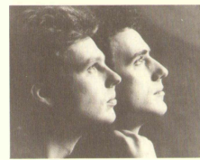
OMD - Virgin