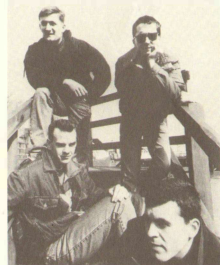
The Housemartins - Chrysalis

Living In A Box - Living In A Box Paul Carrack - Walk In The Room Huey Lewis - Simple As That World Party - Ship Of Fools Go West - I Wanna Hear It From You Art Of Noise - Dragnet