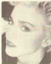
Madonna's tour is building up.

DISTRIBUTED BY WEA RECORDS LTD. A WARNER COMMUNICATIONS CO.