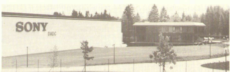
Sony's new factory in Anif, a southern Salzburg suburb, employs approximately 180 people.

In response to other questions, he said that Sony had had no dialogue with its partner CBS on the subject of the Copycode device. He also said that Sony had no acquisition plans as far as pre-recorded software is concerned.